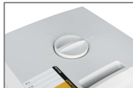
Adjustable Hot Lid