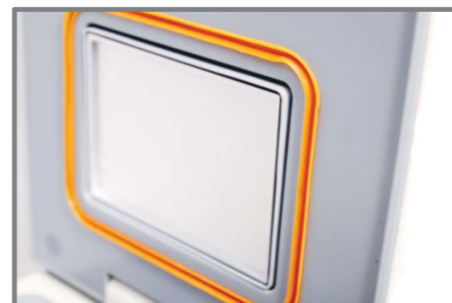
Hermetic Seal Protects Blocks from Condensation