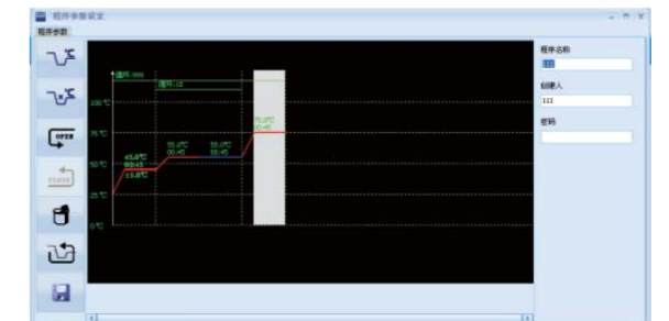
Protocol set by PC Software