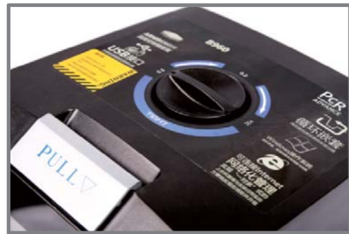
Adjustable Hot Lid

Temperature extended control mode which is closer to required experiment temperature control and is able to effectively avoid the system error caused by the disaccord of the temperature points among the instrument's display temperature, actual block temperature and the temperature required for reagents. So as to improve the accuracy of the experiment and ensure the high efficiency, Strict temperature control debugging program makes sure that each instrument can meet the needs of different experiments. 12 channel temperature probes detect simultaneously, which ensure the homogeneity of sample temperature. The hermetic-space technique can efficiently eliminate PCR marginal effect. The technique of outside temperature probe tracing the inside curve testing can effectively ensure the accuracy of sample temperature.