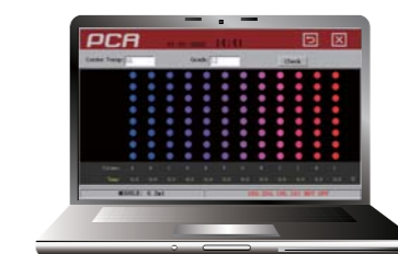
Remote Management System